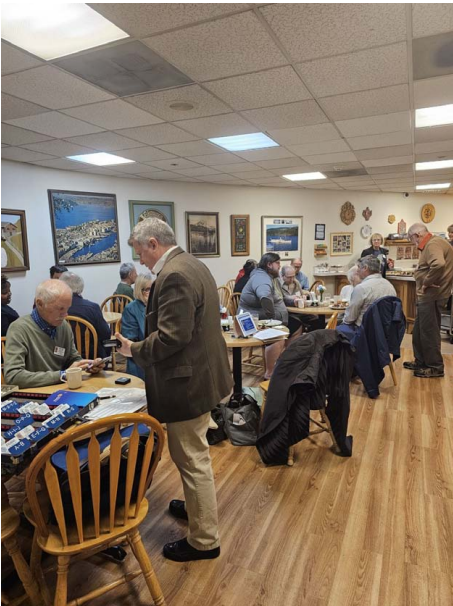
Cozy club scene at Kaffe Stua