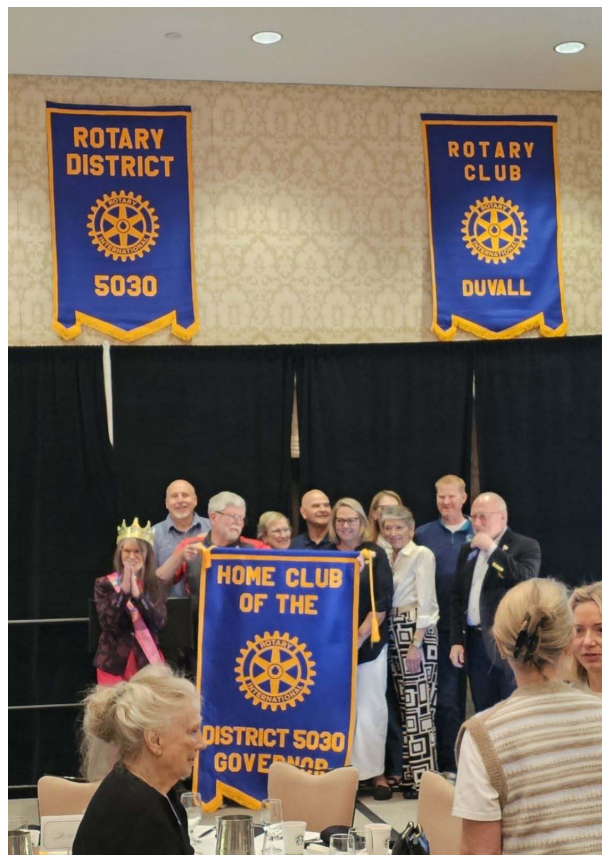
The District 5030 Governor's banner is passed from Seattle 4 to Duvall.