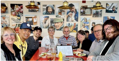
Here's the happy bunch of Rotarians who gathered at Chinook's on April 28th for the President's Social.