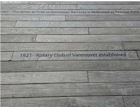
The sign says it all.