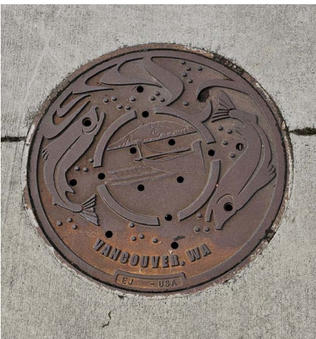
Does the design on this utility hole cover remind you of a certain club's Rotary logo?