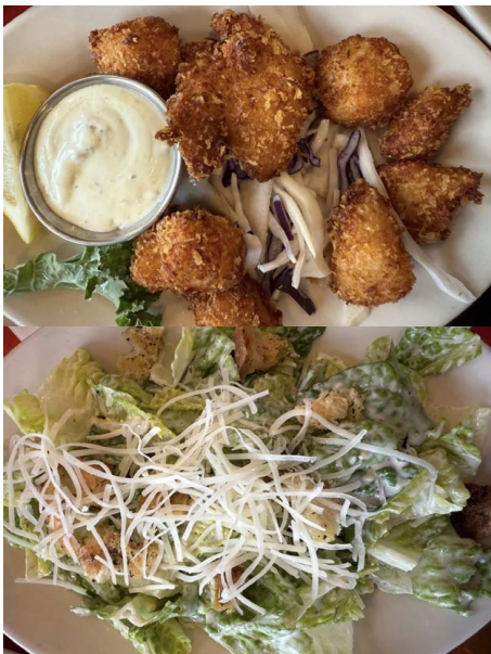
Some of the tasty items that were enjoyed!