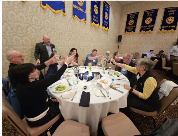
Ballard Rotarians raise a glass at their table