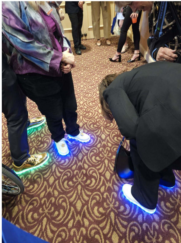
Woodinville Rotarians could be identified by their glowing shoes!